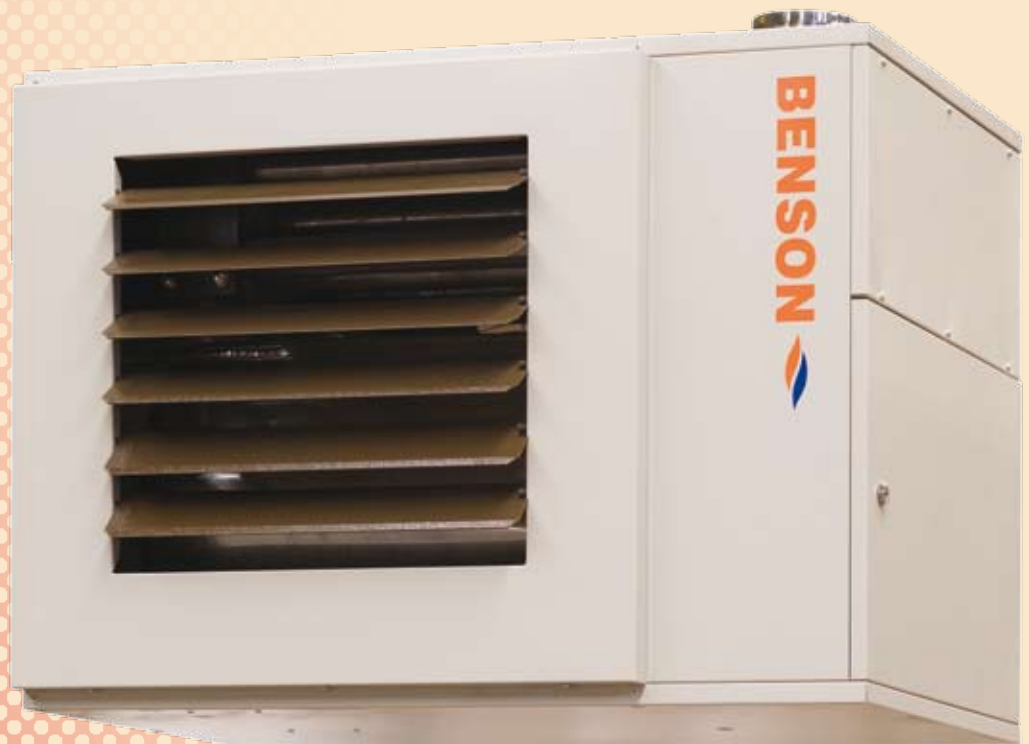
Axial Fan Oil Unit Heater

Comfort and Warmth When and Where Needed